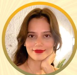
ESHU SINGH SBI PO 2023