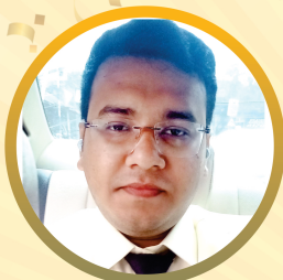
SOUMYADIP BISWAS IBPS PO 2023