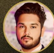
ARYAN NAGAR (SBI CLERK 2024)