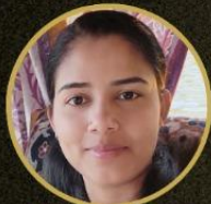
SHIKSHA RANI (SBI CLERK 2024)