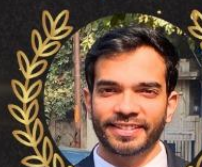
RANJAN (IBPS PO 2025)