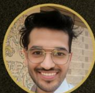
SUYASH (IBPS RRB PO 2024)