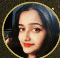
SANGHAMITRA (IBPS RRB CLERK AND PO 2024)