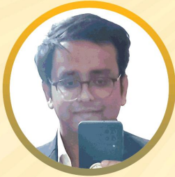
AKARSHAN TIWARI RRB PO 2023