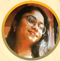
ARUNITA RRB PO & CLERK 2023 IBPS PO & CLERK 2023