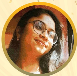
ARUNITA RRB PO & CLERK 2023 IBPS PO & CLERK 2023