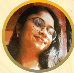
ARUNITA RRB PO & CLERK 2023 IBPS PO & CLERK 2023