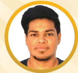
LALIT YADAV IBPS RRB PO 2023

It's Your Turn Now Take A Free Mock Test