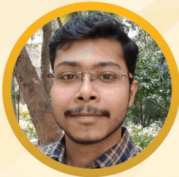
ARNAB BOSE IBPS RRB PO & OA 2023