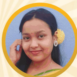
ANJUSHREE GHOSH IBPS RRB PO 2023