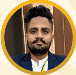
AKSHIT ARORA IBPS RRB PO 2023