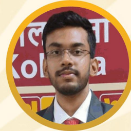
MRINAL BANERJEE IBPS RRB PO 2023