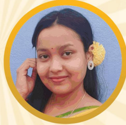
ANJUSHREE GHOSH IBPS RRB PO 2023