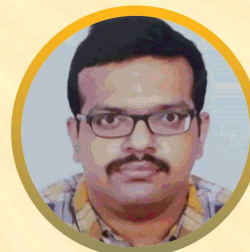
DEBAYAN BHAUMIK IBPS PO 2023 RRB CLERK 2023

It's Your Turn Now Take A Free Mock Test