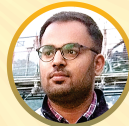
Ansh Gulati IBPS PO & CLERK 2023 SBI PO & RRB CLERK 2023

It's Your Turn Now Take A Free Mock Test