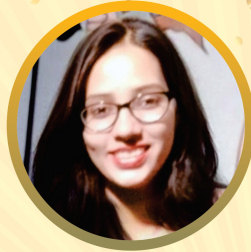
DHAIRYA GAUR RRB PO 2023