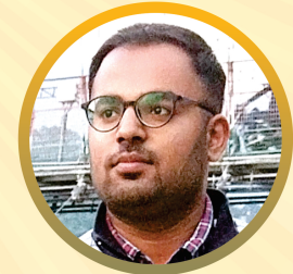
Ansh Gulati IBPS PO & CLERK 2023 SBI PO & RRB CLERK 2023

It's Your Turn Now Take A Free Mock Test