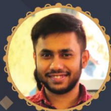
Ritwick Das IBPS PO & CLERK 2022

It's Your Turn Now Take A FREE Mock Test