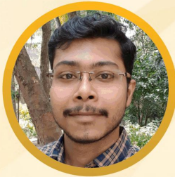
ARNAB BOSE IBPS RRB PO & OA 2023