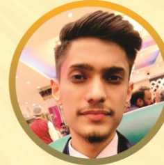
HARDIK SHARMA SBI PO 2023

It's Your Turn Now Take A Free Mock Test