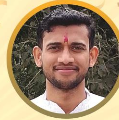
ARIJIT PRATI HAR SBI PO IBPS PO & CLERK 2023